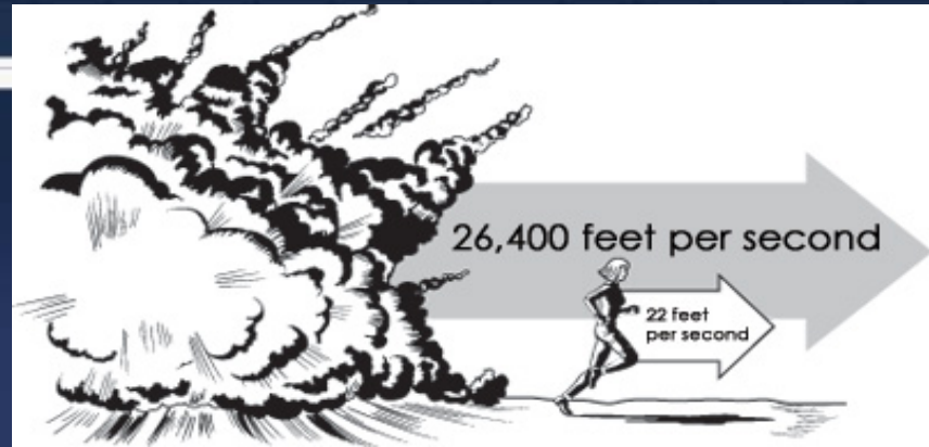
Blast Wind (Primary)