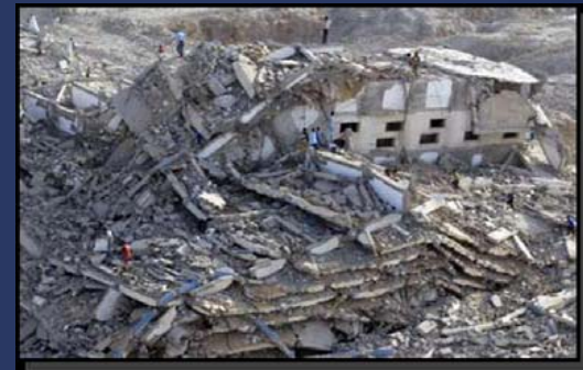
Collapse Building (Quaternary)