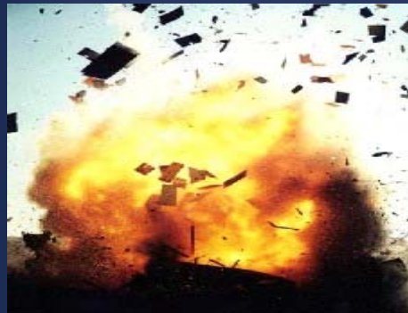
Flying Debris (Secondary)